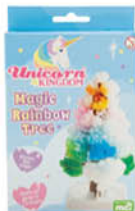
MAGIC RAINBOW TREE