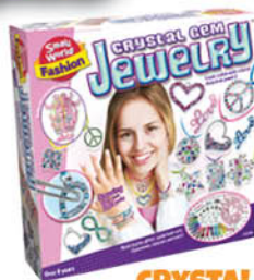
CRYSTAL GEM JEWELRY