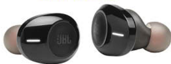
JBL WIRELESS EARPHONES