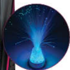
FIBRE OPTIC LAMP