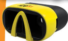
VIRTUAL REALITY GLASSES