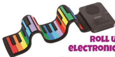
ROLL UP ELECTRONIC PIANO